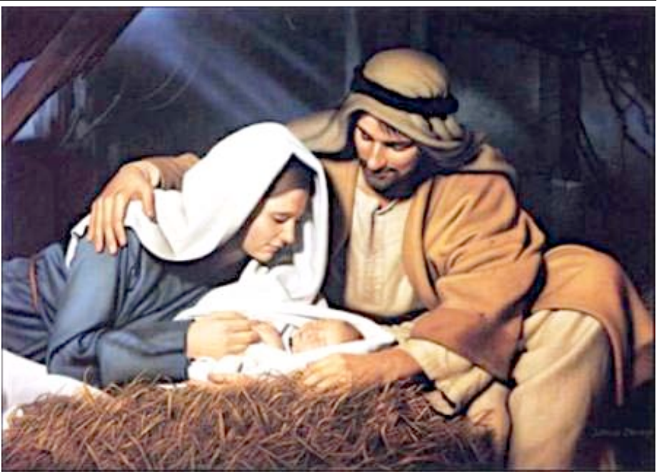
(These readings are those for during the morning on Christmas Day)

Prayers for Healing and Renewal in the Church - Thursdays at 9.00am