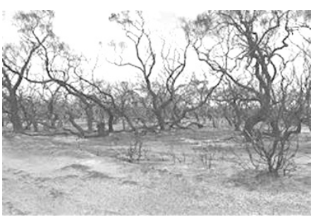
Grief, the Environment and Jesus