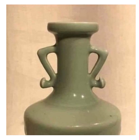
This vase has had enough of your nonsense!

Download prayer resources, including for use in liturgies, read the document and access the submission portal at: <a href="https://www.catholic.org.au/synodalchurch">www.catholic.org.au/synodalchurch</a>.