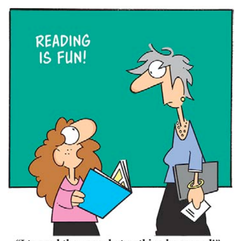
"I tapped the page, but nothing happened!"

You can read, or download, Ron Rolheiser's weekly columns from his website at: <u>www.ronrolheiser.com</u>