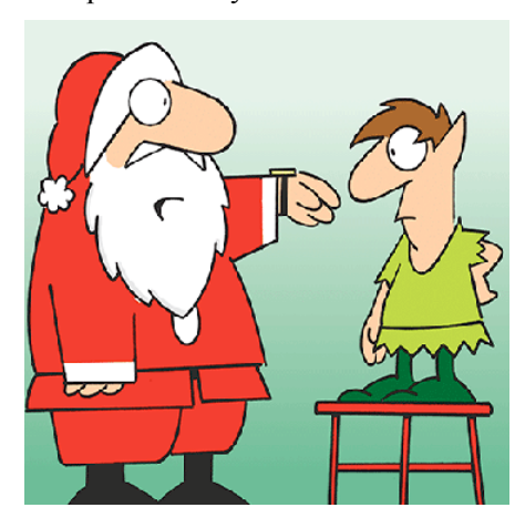
"Mrs Claus bought me a smartwatch! It knows when you are sleeping, it knows when you're awake, it knows if you've been bad or good ..."