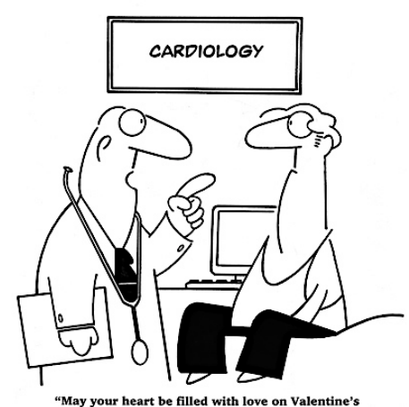
"May your heart be filled with love on Valentine's Day. It leaves less room for cholesterol."