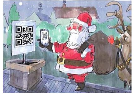
Did you miss out at Christmas?

While they may look simple, QR codes are capable of storing lots of data. But no matter how much they contain, when scanned, the QR code will allow the user to access information instantly – hence why it's called a Quick Response code.