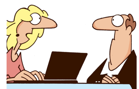
"I love to shop for clothes on the Internet. No mirrors!