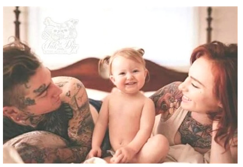
I'm always surprised when heavily tattooed couples have a baby and it comes out blank.