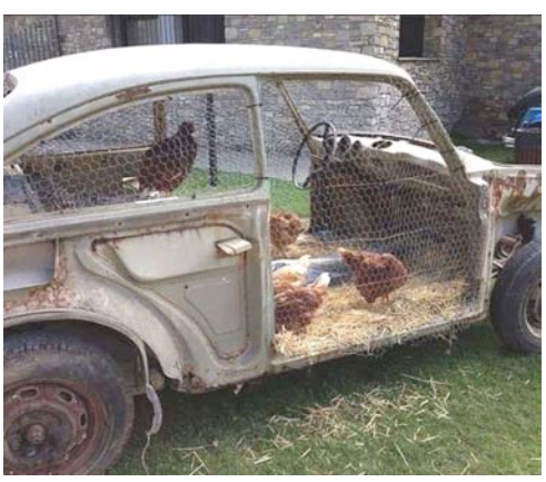
It's a chicken coupe.