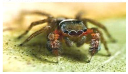
Spiders are the only web designers who are happy when they get a bug.